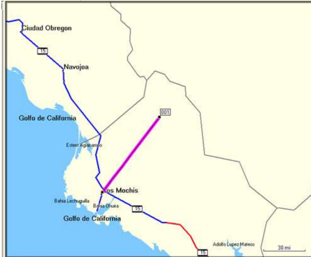
Day 5, Sunday December 28, 2003