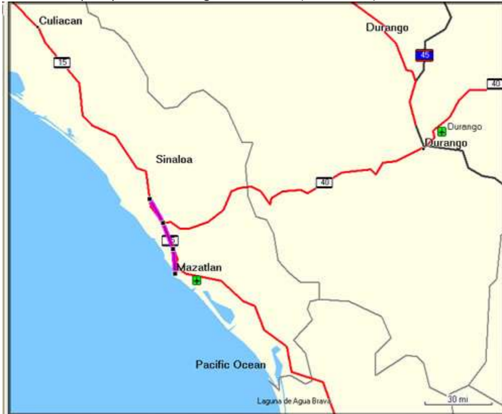
Day 1, Wednesday, December 24, 2003