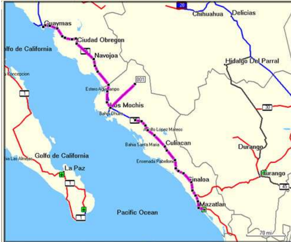
Entire Trip Map - Not including the small ride (18.12 miles) I did near Tucson