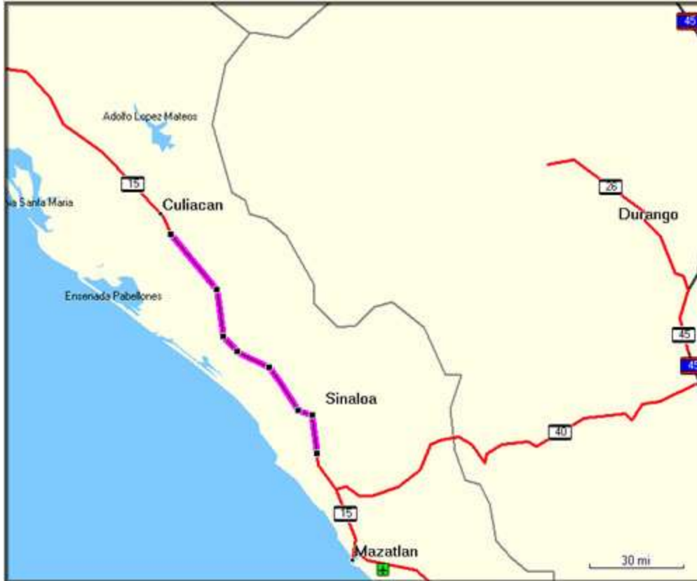
Day 2, Thursday, December 25, 2003