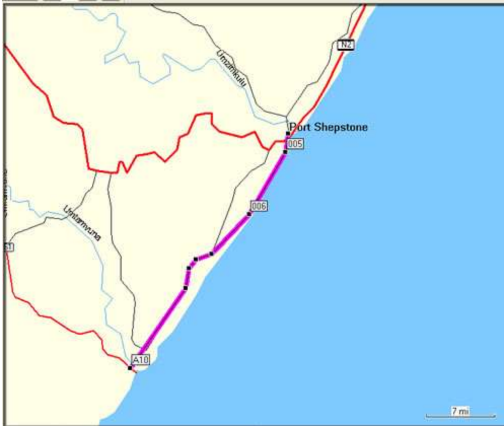
Day 10, Monday, January 3, 2005