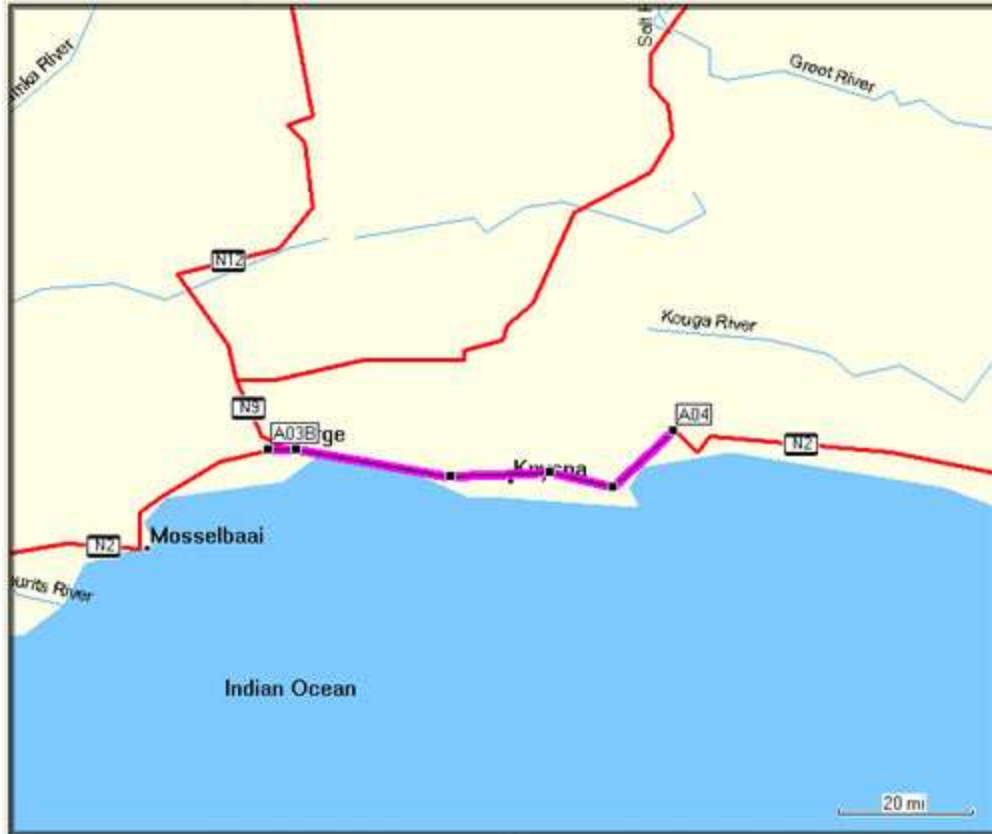
Day 4, Tuesday, December 28, 2004