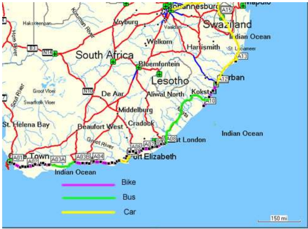
Entire Trip - Each night is mark by Azz (where zz is the night of the trip)