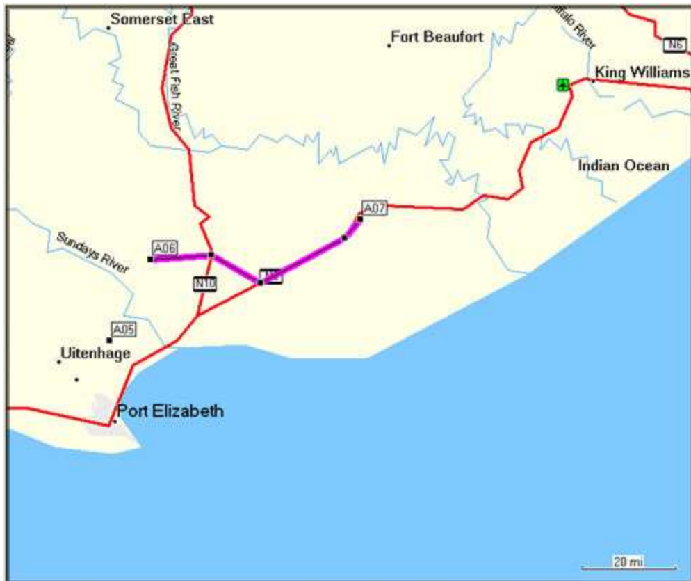
Day 7, Friday, December 31, 2004