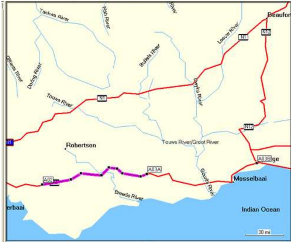
Day 3, Monday, December 27, 2004 - Biked from a little east of Vredenda, SA to Heidelberg, SA; Took a bus from Heidelberg, SA to George, SA