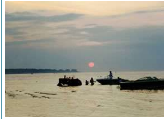
The sun setting on lake Huron near Pinery Provincial Park.