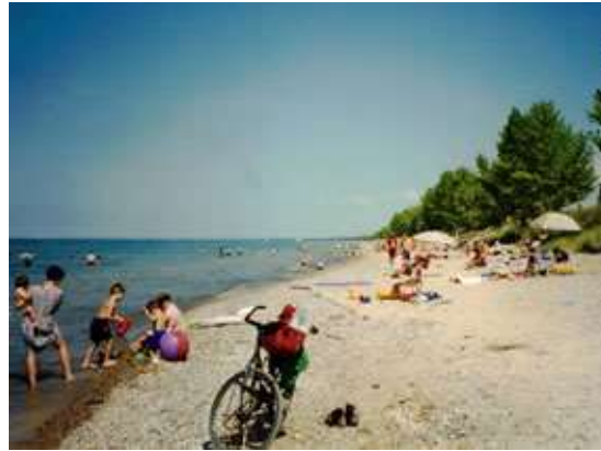
Ted's bike on the beach at Pinery Provincial Park, Ontario, Canada.