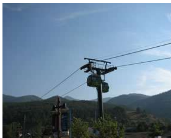
Gondolas at Silver Mountain ski area near Kellogg, Idaho.