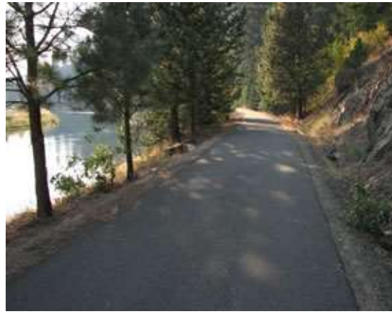
The trail of Coeur d'Alene.