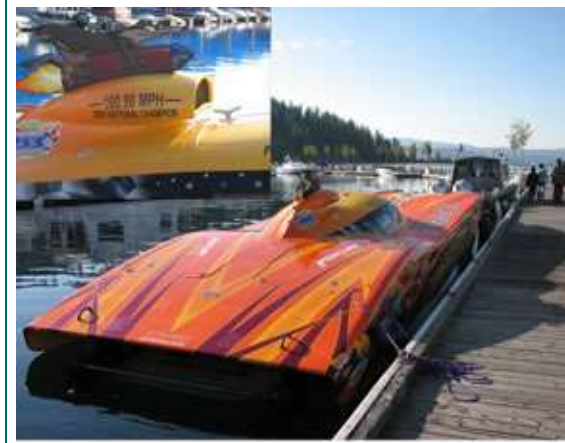
A record setting speed boat docked below the hotel where Ted stayed in Coeur d'Alene, Idaho.