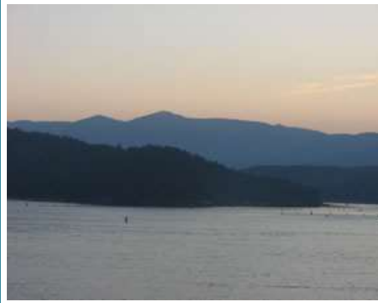
Coeur d'Alene Lake in Idaho.