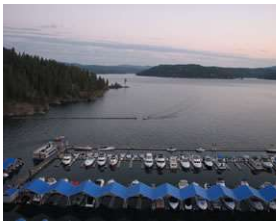
The boats docked under our (Jay and Ted) hotel room at Coeur d'Alene, Idaho.