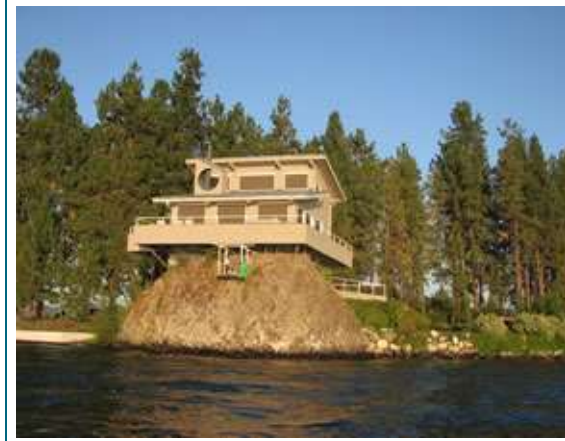
An interested house we saw on rock next to Coeur d'Alene Lake.