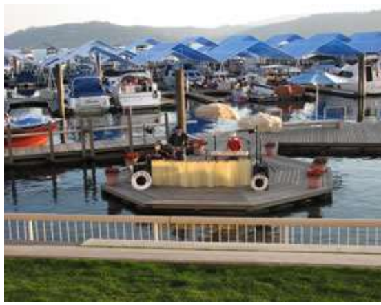
A band set up on the dock below the hotel where Ted stayed at in Coeur d'Alene, Idaho.