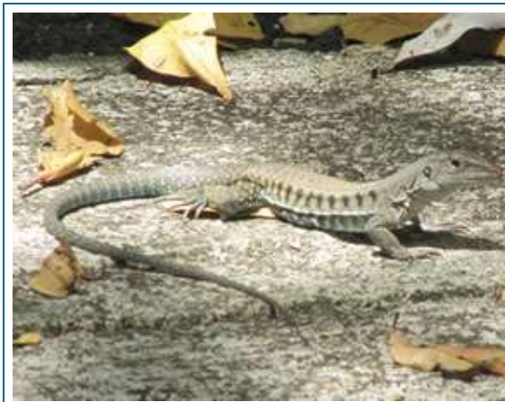
Lizard near Loiza, Puerto Rico.