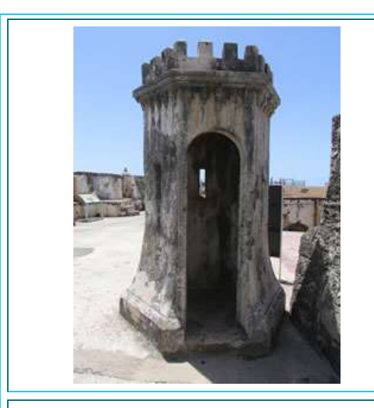
El Morro fort in San Juan, Puerto Rico.