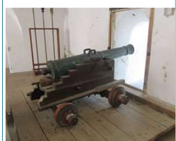
El Morro fort in San Juan, Puerto Rico.