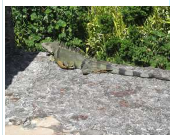
Iguana at the El Morro fort at San Juan, Puerto Rico.