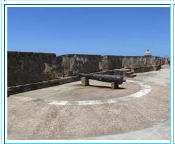
El Morro fort in San Juan, Puerto Rico.