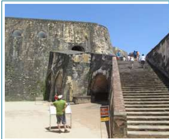
El Morro fort in San Juan, Puerto Rico.