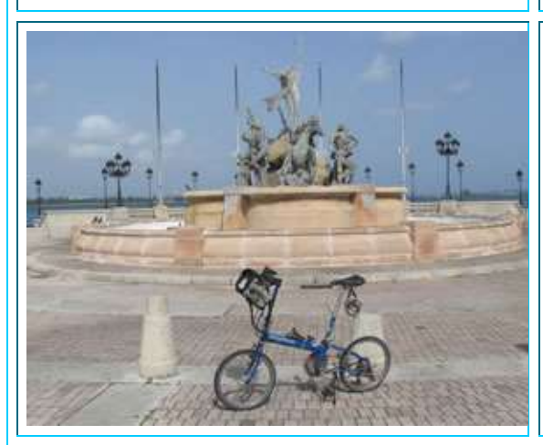
Fountain in San Juan, Puerto Rico.