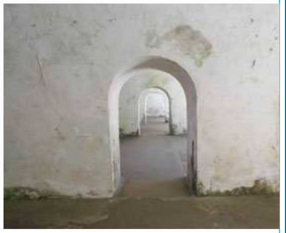
El Morro fort in San Juan, Puerto Rico.