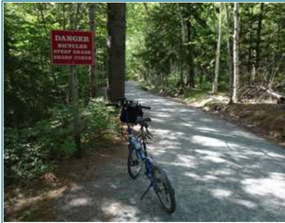
Ted's bike on the road from Witch Hole Pond to the Visitor Center at Acadia National Park.