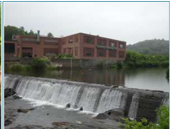
Vermont machine tool shop in Springfield, Vermont.