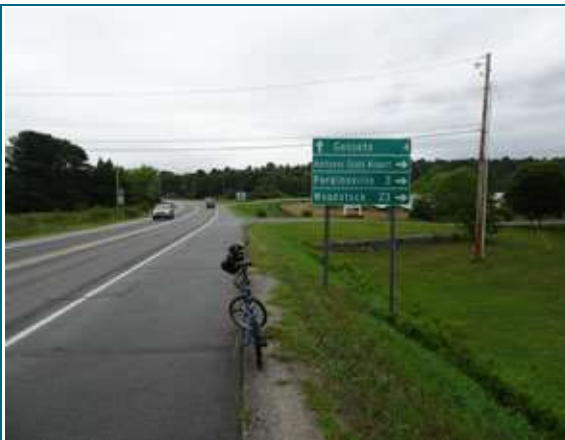
Ted's bike at sign to Woodstock, Vermont. Then Ted headed back towards New Hampshire.