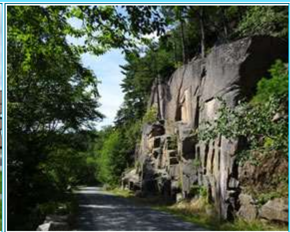
Carriage road in Acadia National Park