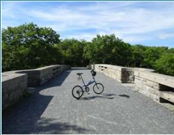
Ted's bike on Duck Brook Bridge at Acadia National Park.