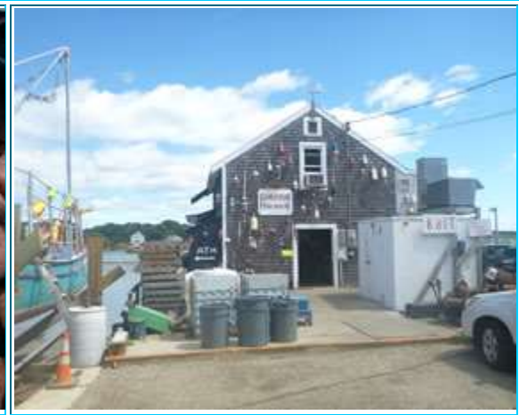
Lobster retail store in Cape Porpoise, Maine