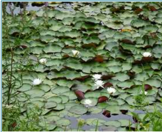
Pond seen from Windham rails to trails in New Hampshire.