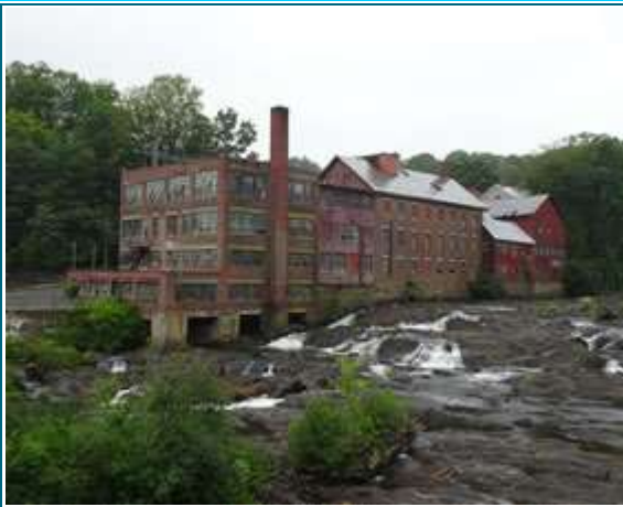
Old falling apart building in Springfield, Vermont.