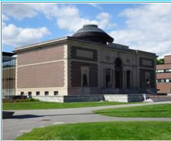
Building at Bowdoin College, where Ted's dad went to school.