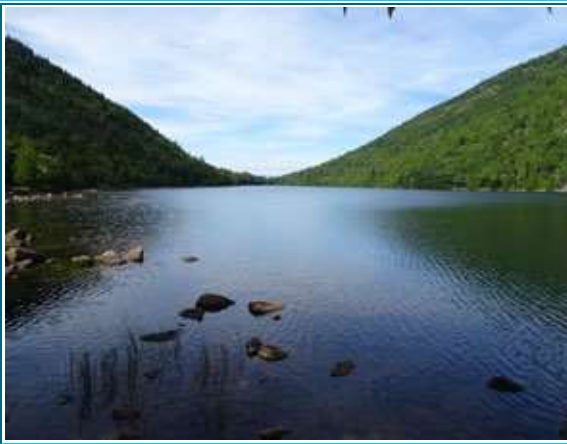
Jordan Pond in Acadia National Park.