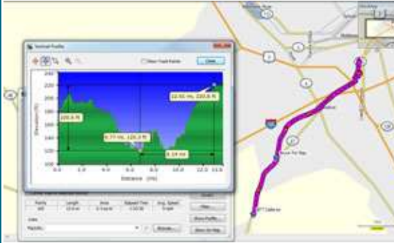
Profile of Bruce Freedom trail bike trail in Massachusetts.