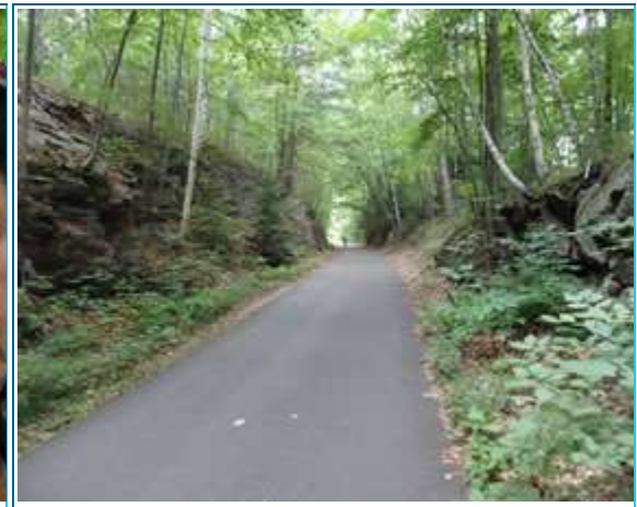
View of Windham rails to trails in New Hampshire.