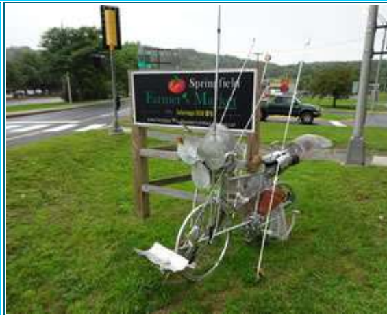
Bike art in Springfield, Vermont.