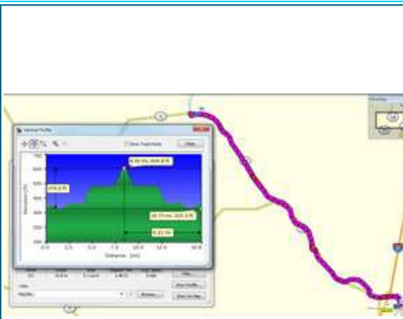
Profile of near Springfield, Vermont bike ride