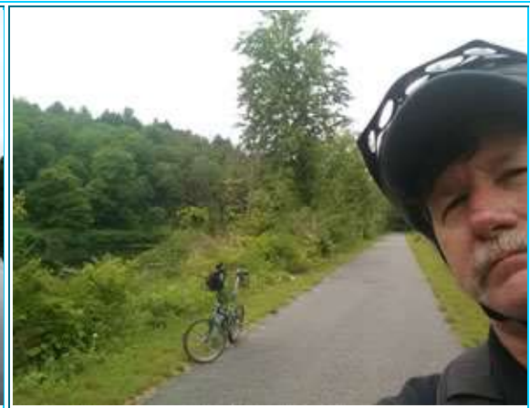
Ted's bike on the Toonerville rails to trail near Springfield, Vermont.