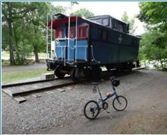
Caboose at North end of the Windham rails to trails in New Hampshire.