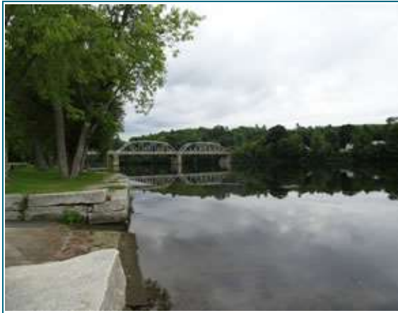
The bridge that crosses the Connecticut River near Charleston, New Hampshire taken from the Vermont side of the river.