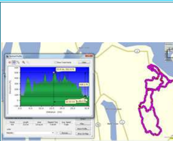
Profile of Acadia National Park/ Bar Harbor, Maine bike ride